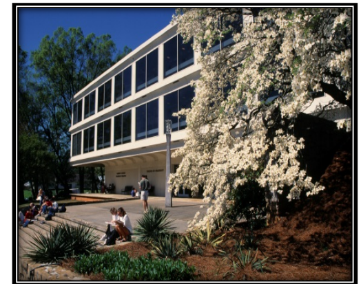
R.C. Wilson Pharmacy Building