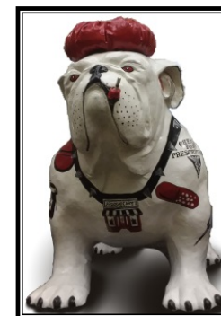
College of Pharmacy Mascot "Pharm Dawg"