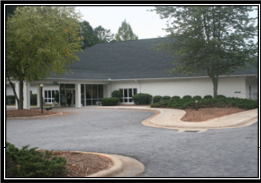
VA Outpatient Clinic