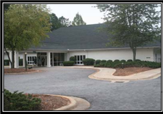
VA Outpatient Clinic