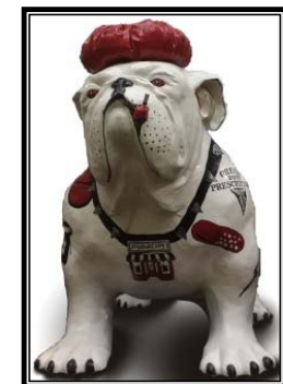
College of Pharmacy Mascot "Pharm Dawg"