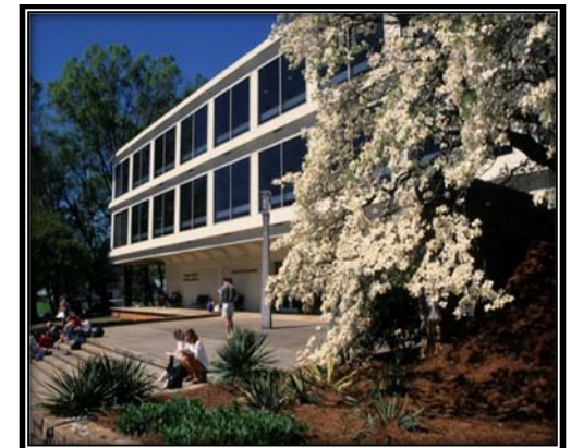
R.C. Wilson Pharmacy Building