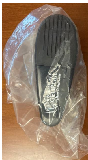
Magnetic Chip Clip