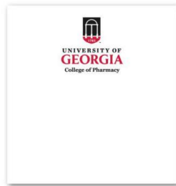
Post-It Notes - 25 Sheets