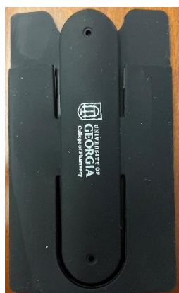
Phone Case Wallet with Grip