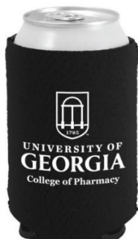
Kolder Kaddy Neoprene