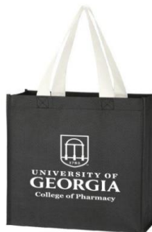
9" x 12" Tote Bag