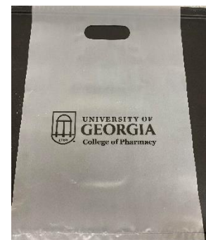
9 1/2" x 14" Aster Bag (Clear)