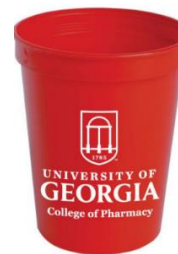
16 oz. Stadium Cup