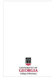
Non-Adhesive Scratch Pad – 25 Sheets