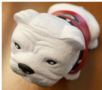
Uga Stress Reliever