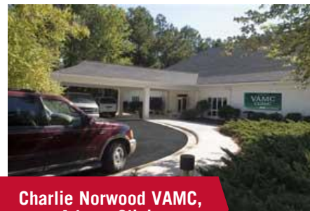
Charlie Norwood VAMC, Athens Clinic