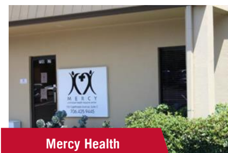
Mercy Health Center