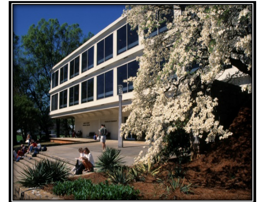
R.C. Wilson Pharmacy Building