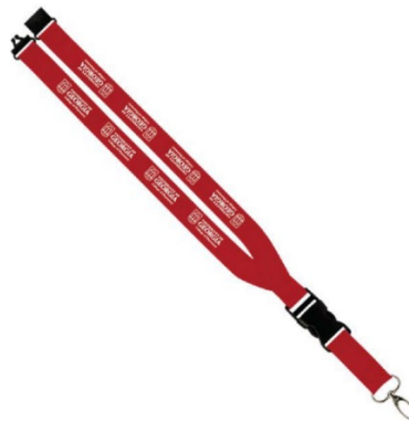
Polyester Lanyard with Oval Clip