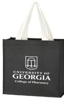
9" x 12" Tote Bag