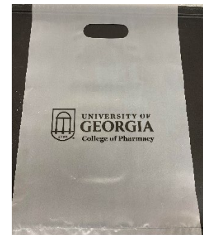
9 1/2" x 14" Aster Bag (Clear)