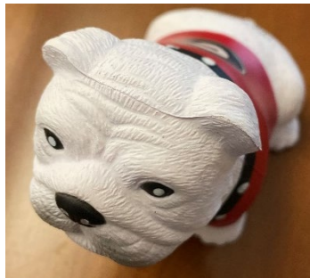
Uga Stress Reliever