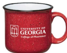
15 oz. Campfire Mug