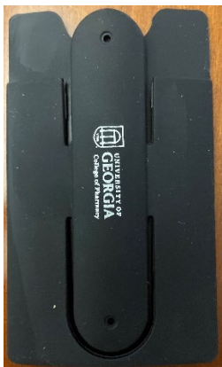
Phone Case Wallet with Grip