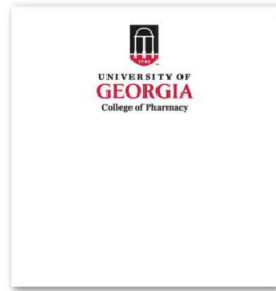
Post-It Notes - 25 Sheets