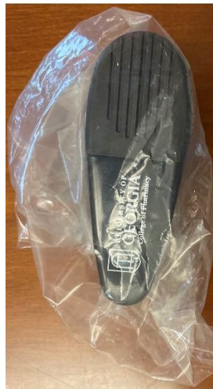
Magnetic Chip Clip