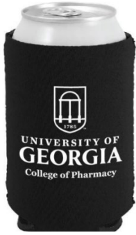
Kolder Kaddy Neoprene