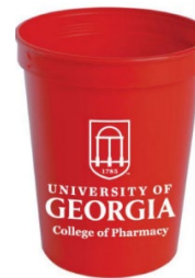
16 oz. Stadium Cup